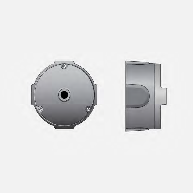
Direct burial wiring box · Direct burial wiring box