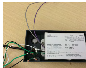
Figure 4 (generic image)