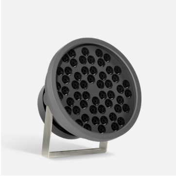
Figure 1: Yolk Mounting Detail